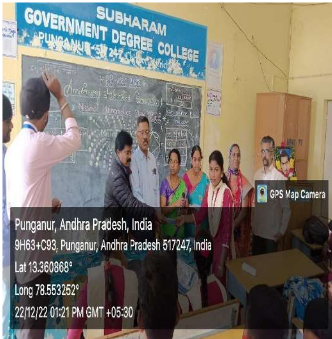
Punganur, Andhra Pradesh, India 9H63+C93, Punganur, Andhra Pradesh 517247, India Lat 13.360868° Long 78.553252° 22/12/22 01:21 PM GMT +05:30