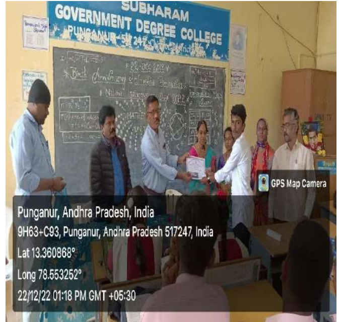
Punganur, Andhra Pradesh, India 9H63+C93, Punganur, Andhra Pradesh 517247, India Lat 13.360868° Long 78.553252° 22/12/22 01:18 PM GMT +05:30