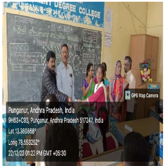
Punganur, Andhra Pradesh, India 9H63+C93, Punganur, Andhra Pradesh 517247, India Lat 13.360868° Long 78.553252° 22/12/22 01:22 PM GMT +05:30